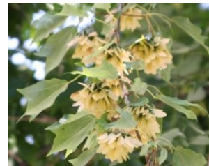
Trident maple ( Acer buergerianum ) Late summer