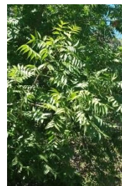
Chinese pistache ( Pistachia chinensis ) Mid-summer through early fall