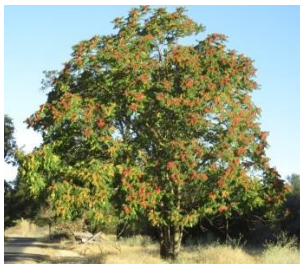
Tree of heaven ( Ailanthus altissima ) Early spring through late summer