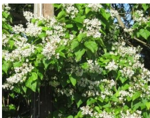
Catalpa ( Catalpa spp.) Summer