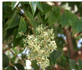
Privet ( Ligustrum spp.) Late summer